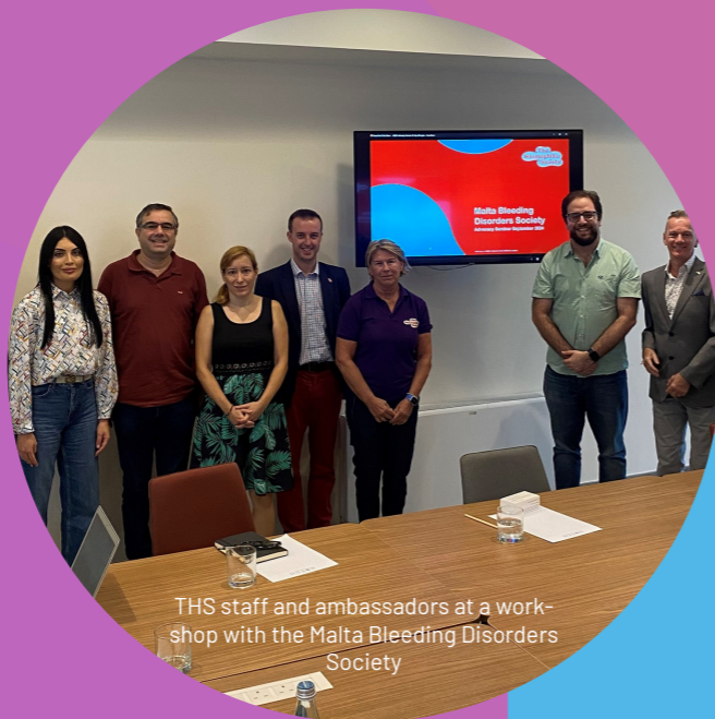
THS staff and ambassadors at a workshop with the Malta Bleeding Disorders Society

This year, we welcomed a family from Malta to the UK attend our Youth Camp, which we hope will inspire a similar event in the future. A delegation of staff, Young Ambassadors and trustees travelled to Malta in September 2024 for a weekend of workshops and advocacy, culminating in some of the team undertaking the Gozo to Malta open water swim to raise money for a youth support event in the country. We really value the strengthening ties that are developing between our two organisations.