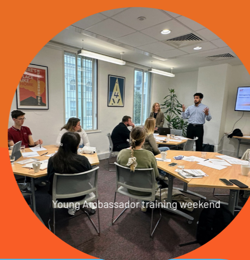
Young Ambassador training weekend