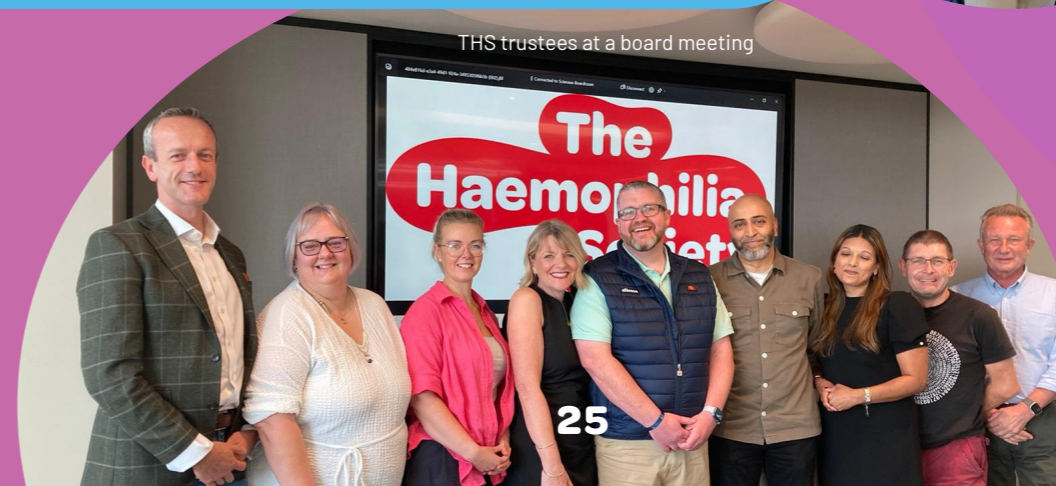
THS trustees at a board meeting