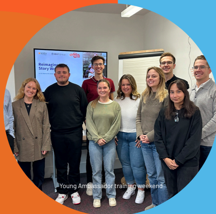
Young Ambassador training weekend

Our Young Ambassadors also regularly attend global conferences to share their experiences, helping them to build their skills to become advocates for themselves and our community.