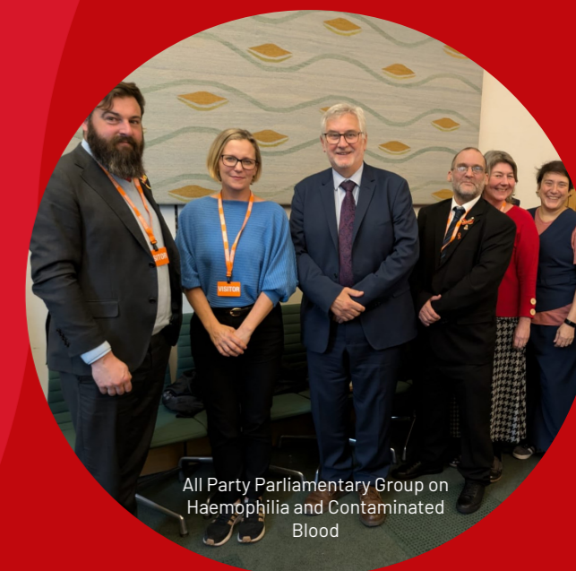
All Party Parliamentary Group on Haemophilia and Contaminated Blood

A new draft service specification was finalised which will establish an important baseline in bleeding disorder care. It focusses on access to full multidisciplinary care, improving people's rights to physiotherapy, providing better care to women and girls with bleeding disorders and providing more psycho-social support. This will be consulted on in 2025 and come into force in 2026.