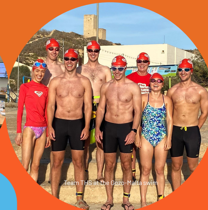
Team THS at the Gozo-Malta swim

'The Malta Swim Challenge summarised why we all do what we do – it proved to others, and more importantly to ourselves, that our bleeding disorders aren't barriers, and that overcoming the physical and mental challenges often takes a village, which is exactly what we had around us. Completing the challenge alongside friends and family without bleeding disorders also highlighted the importance of a supportive community.'