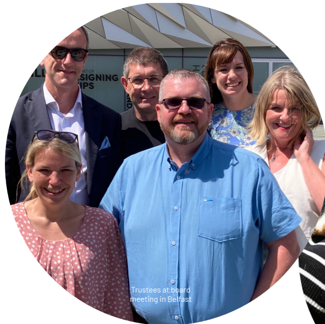
Trustees at board meeting in Belfast